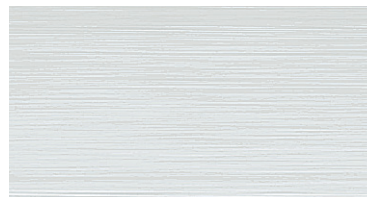
FLUSH PANEL WITH WOODGRAIN EMBOSSEMENT